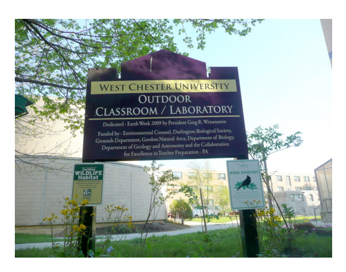
First Outdoor Classroom/Laboratory