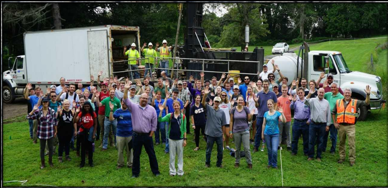
WCU Geoscience students, alumni, and geologists across North America collaborate during a sonic well drilling demo on South Campus Fall 2018. (Special thanks to Midwest Geosciences Group and Cascade Drilling!)