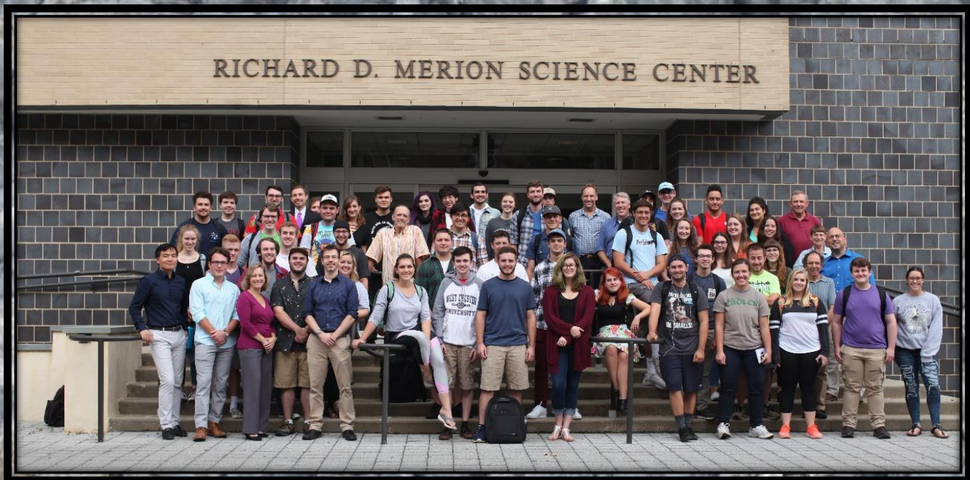
Earth and Space Science Faculty & Students